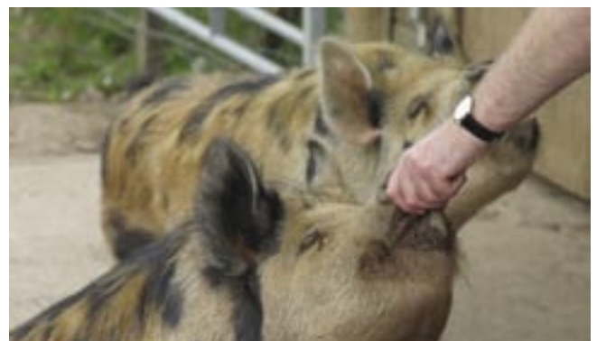
Thelma and Louise (Kune Kune Sows)

Ideally, round the clock care of the animals would be provided by patients, emphasising the responsibility involved in caring for animals and fostering this sense of dependency. However this is currently not possible as the Centre is only open Monday to Friday although this may change in the future. The animals are cared for by staff from other Centres who work at the weekend. This means always keeping in mind what is happening with the animals during the week so this information can be passed on, for example, do any animals need to be isolated, given medication or a special diet? To ensure that we remember everything we have a noticeboard in the main animal shed. On public holidays staff take turns to come in, usually on overtime.