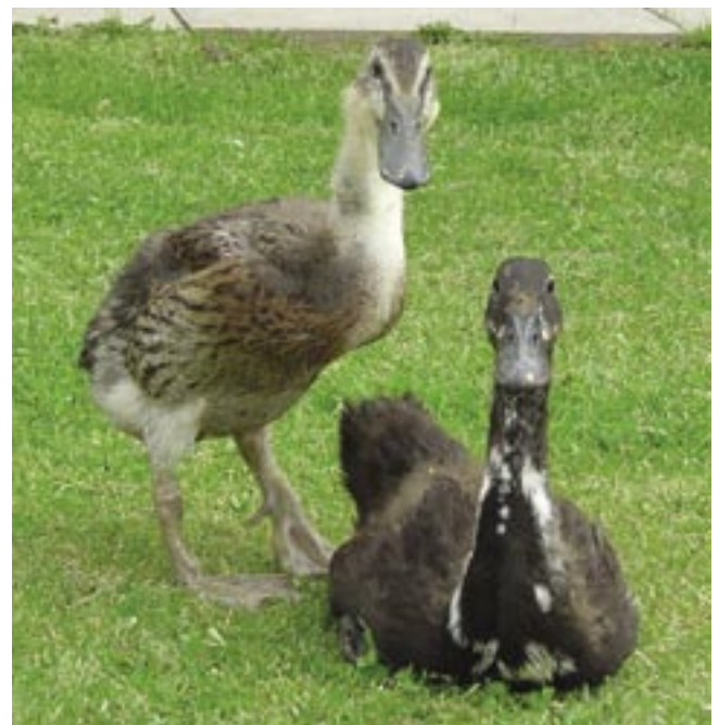
Two Indian Runner Ducks

A member of staff had gathered a great deal of information about animals benefiting patients with mental health problems, and as a result of this enthusiasm animals were introduced. This individual had already helped to set up a pigeon loft for patients within the Learning Disability ward where they were able to care for the birds initially. This led to racing pigeons through a local Pigeon Club. Even patients with the most enduring learning disability were able to handle the birds gently. Their sense of achievement and wellbeing in successfully rearing young birds was remarkable and notably motivational. Membership of the local club made patients feel “accepted” and part of the local community.