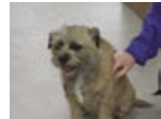
Fudge (Border Terrier)

A number of studies have shown increased social interaction in psychiatric patients during dog visits. These have been treated with caution because it was thought that any gains might be due to the novelty factor. One study addressed this issue. Five long-stay psychiatric patients who showed reluctance to begin conversations, unable or unwilling to sustain a conversation, had motor retardation and lack of interest in their environment, took part in a study to assess the effects of Animal Assisted Therapy. Consistent baseline measures were taken over two weekly sessions, followed by 14 weekly sessions of a 90 minute visit from a dog and handler. Verbal and non-verbal behaviours increased during the dog visits, and this effect was sustained throughout the study (Hall & Malpass 2000).