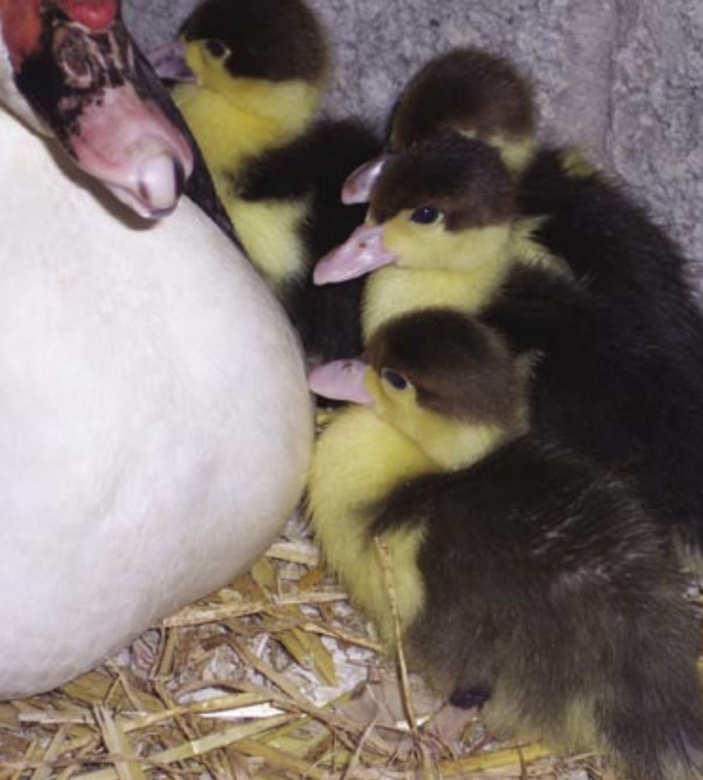
Muscovy Duck and Ducklings

“I like working with the animals because they need a lot of looking after, and the benefit of looking after the animals is that you can get a bond with them.”