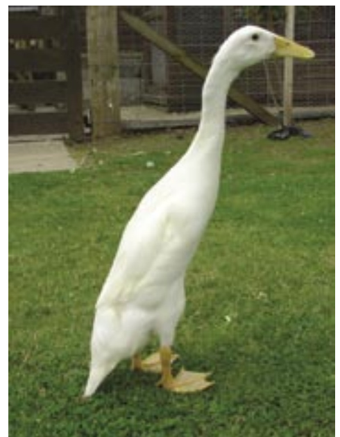
Fergie (Indian Runner Duck)