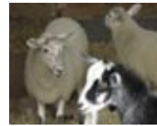
Lambs and Goat

The State Hospital has the advantage of the animals receiving routine care and consequently providing the best therapy