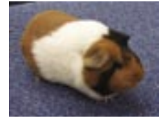
Molly (Guinea Pig)

all our animals receive regular care with their needs adequately and timeously catered for