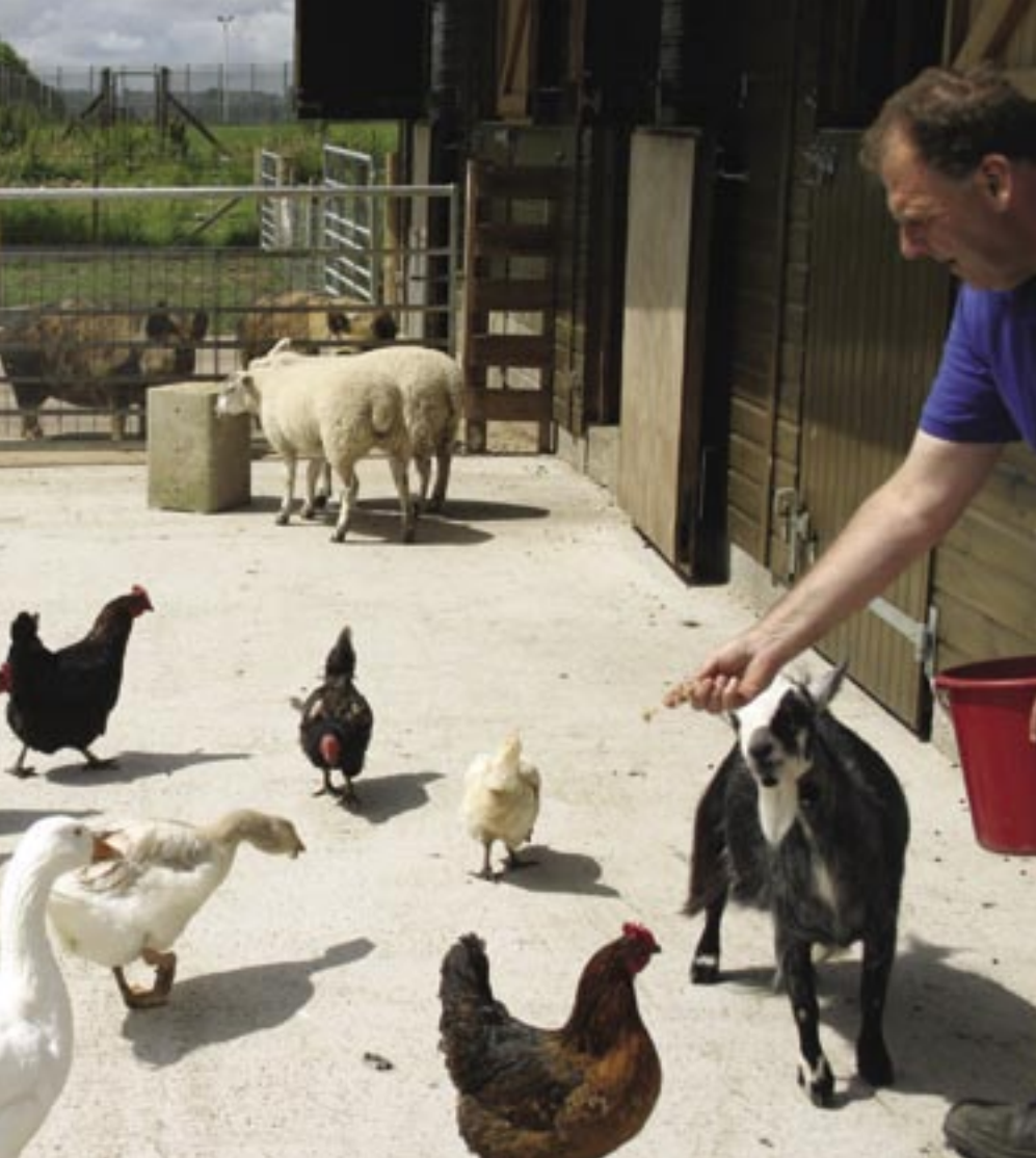
Animals in the Farmyard

"It's good to watch the chickens pecking for food and grain."