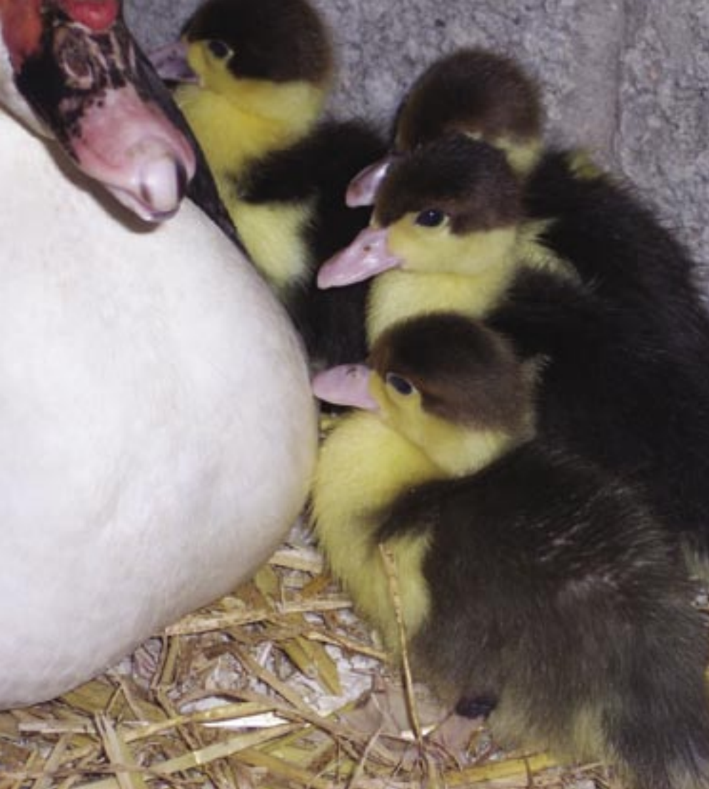
Muscovy Duck and Ducklings

"I like working with the animals because they need a lot of looking after, and the benefit of looking after the animals is that you can get a bond with them."