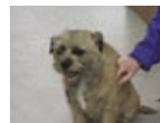
Fudge (Border Terrier)

A number of studies have shown increased social interaction in psychiatric patients during dog visits. These have been treated with caution because it was thought that any gains might be due to the novelty factor. One study addressed this issue. Five long-stay psychiatric patients who showed reluctance to begin conversations, unable or unwilling to sustain a conversation, had motor retardation and lack of interest in their environment, took part in a study to assess the effects of Animal Assisted Therapy. Consistent baseline measures were taken over two weekly sessions, followed by 14 weekly sessions of a 90 minute visit from a dog and handler. Verbal and non-verbal behaviours increased during the dog visits, and this effect was sustained throughout the study (Hall & Malpass 2000).