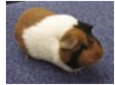
Molly (Guinea Pig)

all our animals receive regular care with their needs adequately and timeously catered for