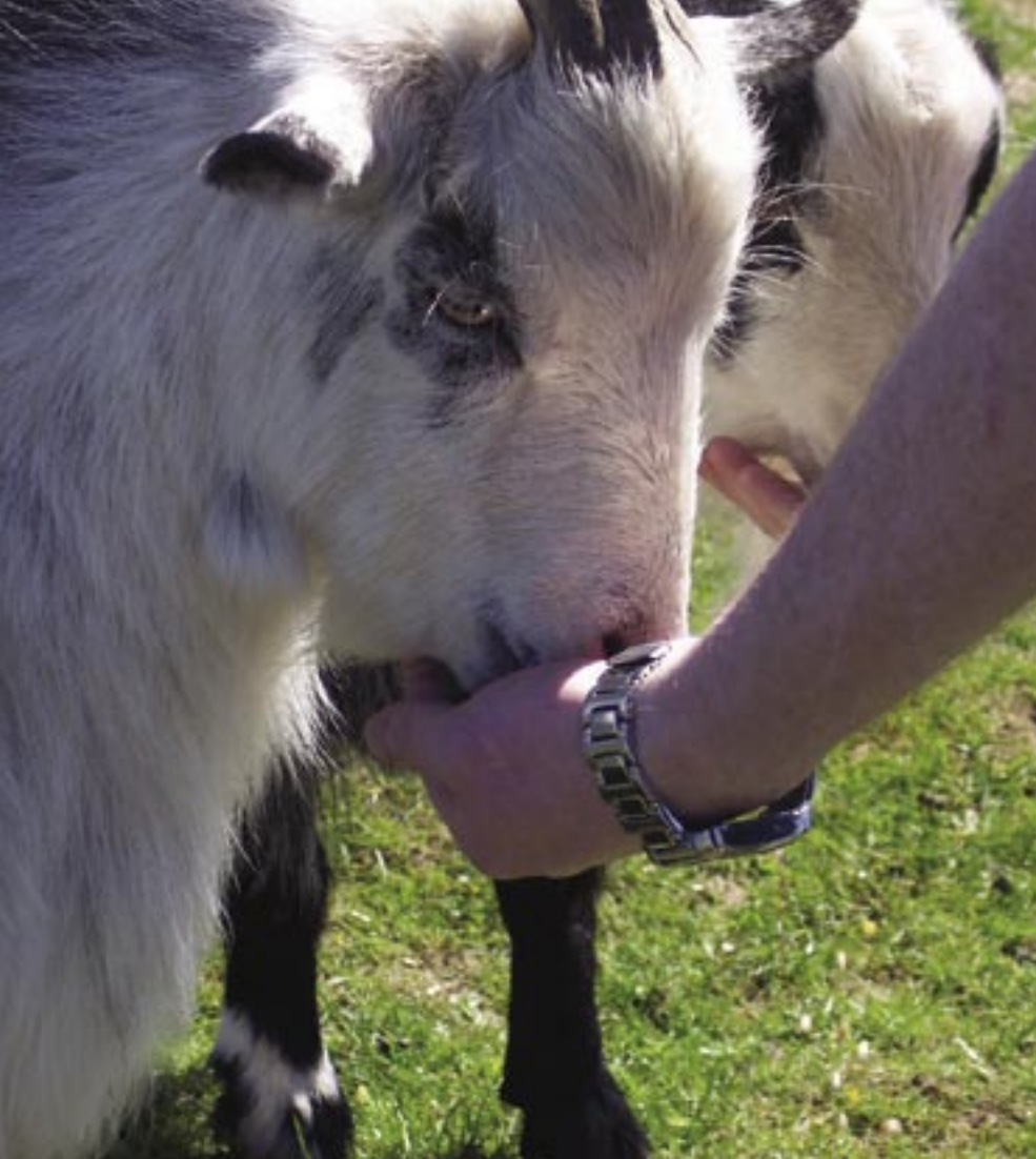
Holly and Noel (Pygmy Goats)

“The gardens offer a wide range of activities from horticulture to pet handling of rabbits and guinea pigs to kune kune pigs, goats and hens. You are encouraged to handle and feed, leaving a sense of wellbeing.”