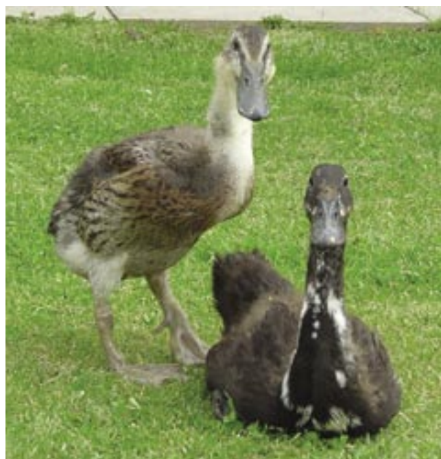
Two Indian Runner Ducks

A member of staff had gathered a great deal of information about animals benefiting patients with mental health problems, and as a result of this enthusiasm animals were introduced. This individual had already helped to set up a pigeon loft for patients within the Learning Disability ward where they were able to care for the birds initially. This led to racing pigeons through a local Pigeon Club. Even patients with the most enduring learning disability were able to handle the birds gently. Their sense of achievement and wellbeing in successfully rearing young birds was remarkable and notably motivational. Membership of the local club made patients feel “accepted” and part of the local community.