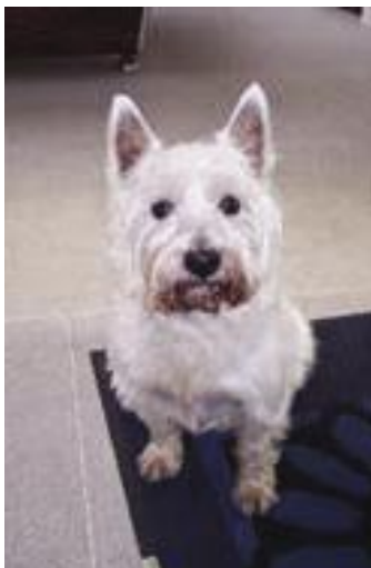
Harvey (West Highland Terrier)

This, together with our knowledge of the individual requirements of all our animals, ensures they receive regular care with their needs adequately and timeously catered for. Additionally, we take steps to avoid our animals becoming ill, not only to minimise vet fees but to avoid the distress to the animal and carers.