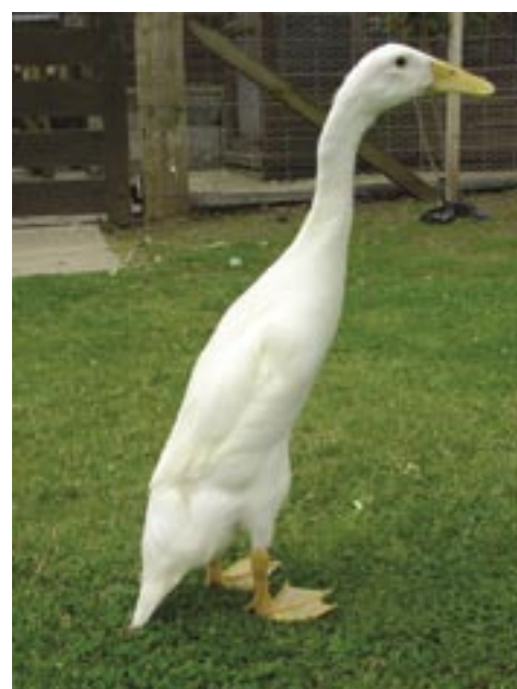
Fergie (Indian Runner Duck)