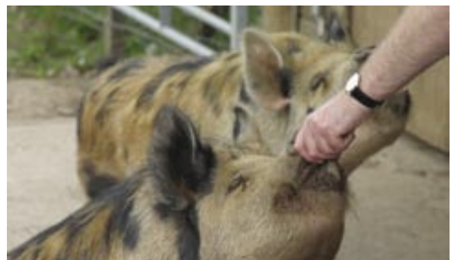
Thelma and Louise (Kune Kune Sows)

Ideally, round the clock care of the animals would be provided by patients, emphasising the responsibility involved in caring for animals and fostering this sense of dependency. However this is currently not possible as the Centre is only open Monday to Friday although this may change in the future. The animals are cared for by staff from other Centres who work at the weekend. This means always keeping in mind what is happening with the animals during the week so this information can be passed on, for example, do any animals need to be isolated, given medication or a special diet? To ensure that we remember everything we have a noticeboard in the main animal shed. On public holidays staff take turns to come in, usually on overtime.