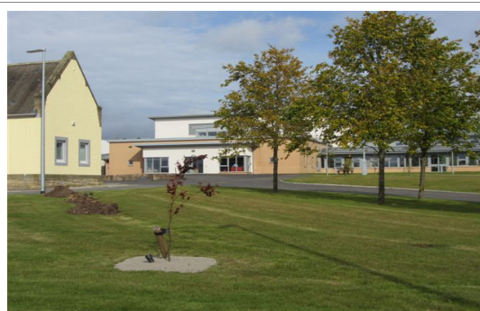
Skye Centre for Patient Therapy and Activity

Spiritual and pastoral care activities are also facilitated within this environment.